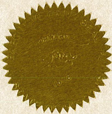
TONY EVERS GOVERNOR